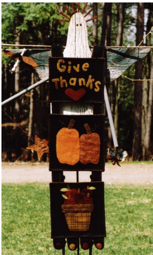
Give Thanks (Kit $49.00) 10" x 31"