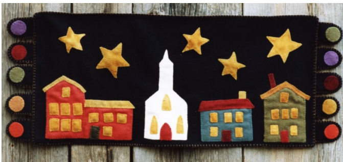
Towne Square (Kit $69.00) 15" x 30"

Pattern purchase $11.00 if not buying a kit.