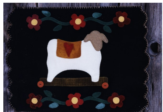
Olde Thyme Lamb (Kit $49) 13" x 17"