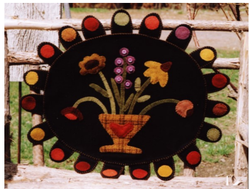
Backyard Blossoms (Kit $59.00) 20" x 17"