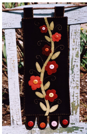
Flowering Vine (Kit $39.00) 8" x 13"